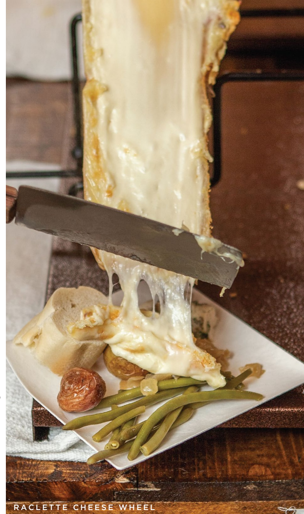
RACLETTE CHEESE WHEEL