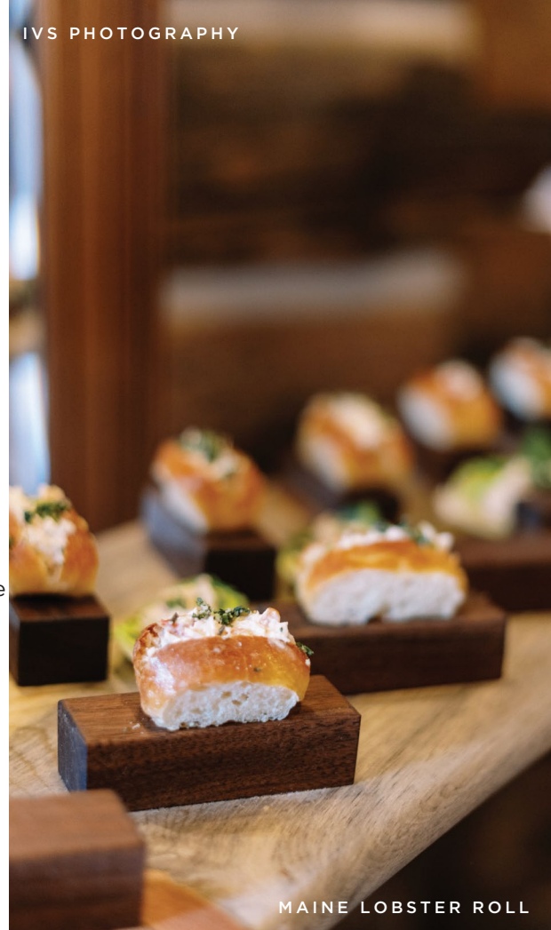
MAINE LOBSTER ROLL

lemon cheesecake filling, candied lemon zest, graham cracker crumb