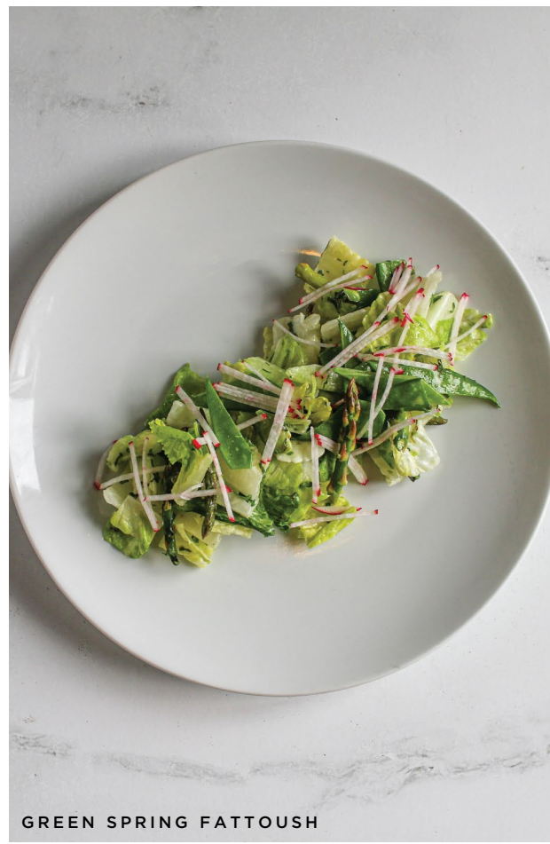
GREEN SPRING FATTOUSH