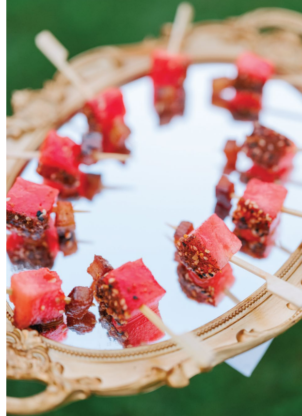
SWINE ON TWINE