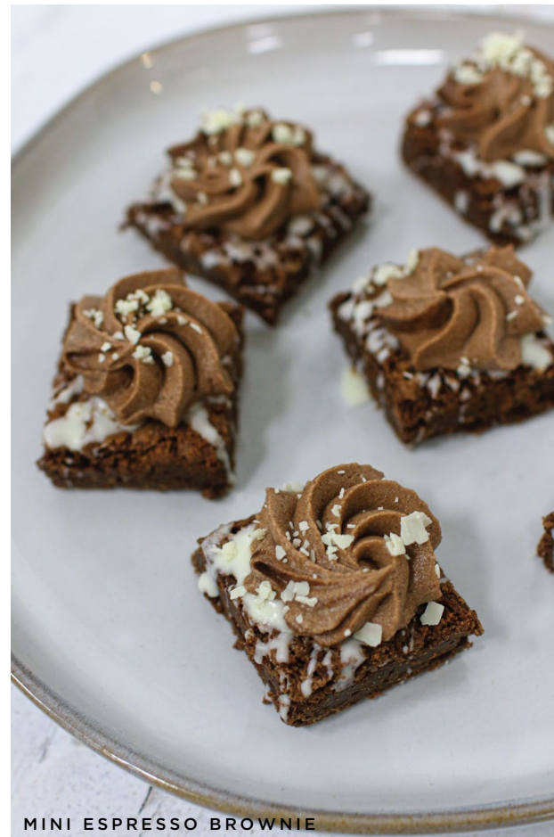
MINI ESPRESSO BROWNIE