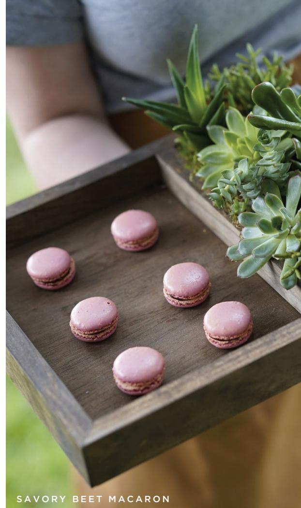
SAVORY BEET MACARON

custom created handmade ice cream milkshakes