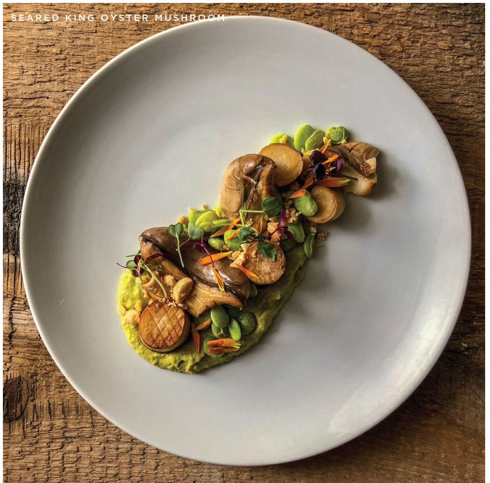
SEARED KING OYSTER MUSHROOM