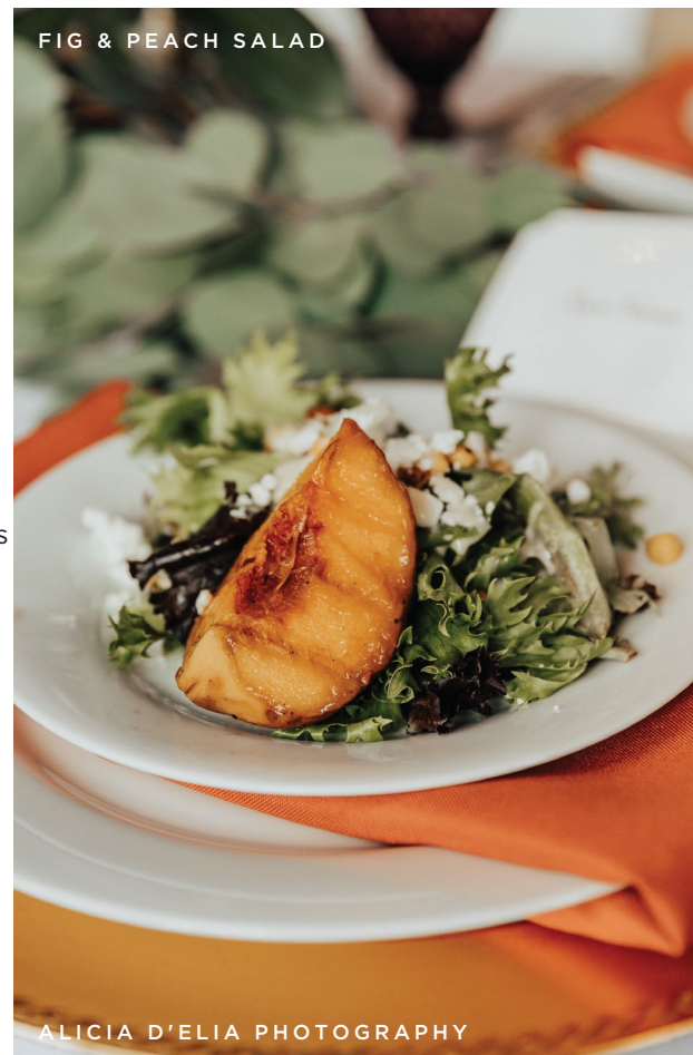
FIG & PEACH SALAD