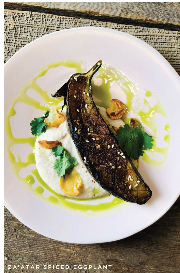
ZA'ATAR SPICED EGGPLANT